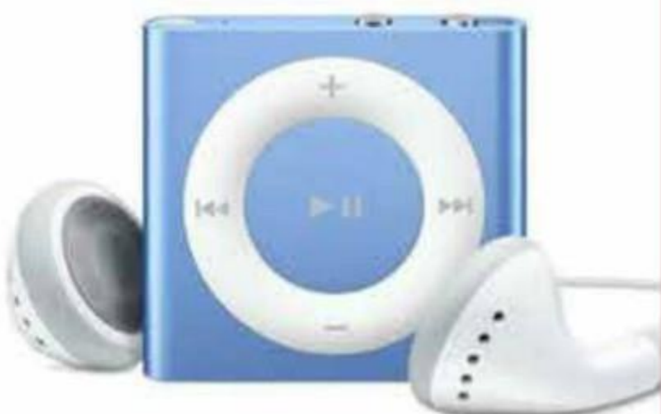
◀ Apple IPOD